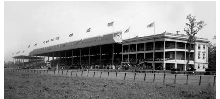
The clubhouse and grandstand at Belmont Park on its opening in 1905.