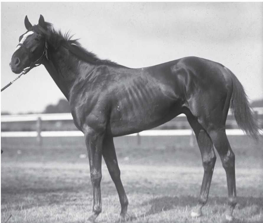
Sir Barton won the Belmont Stakes in 1919 to become the first Triple Crown winner.

In a tribute to Secretariat and his dominant victory, Belmont Park erected the Secretariat Pole just inside the railing – 31½ lengths short of the finish line. And a bronze statue of the famous horse stands inside the Belmont Park paddock.