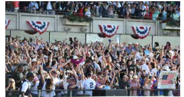
A capped, sold-out crowd of 90,000 watch American Pharoah break the 37-year Triple Crown drought, to become the 2015 Triple Crown winner at the Belmont Stakes.