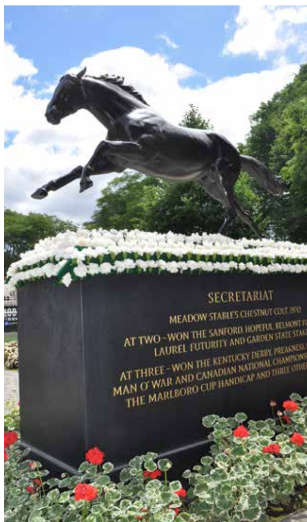
A bronze statue of Secretariat, who won the 1973 Triple Crown by a record 31 ½ lengths, is on display in Belmont Park's paddock.