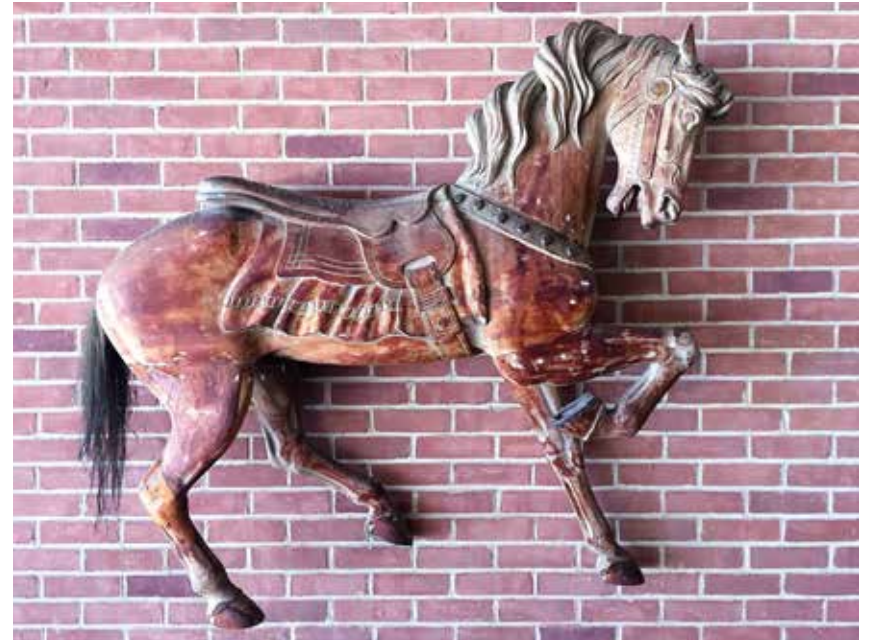
Carousel horses, which date to the early 20th century, adorn the walls of the Garden Terrace Restaurant on the fourth floor of the Belmont Park Clubhouse

What does the Belmont Stakes and Claiborne Farm have in common?