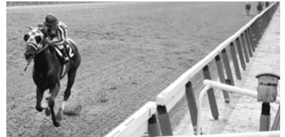
Secretariat's historic by win by 31 lengths at 2 minutes and 24 seconds has not been broken and remains one of the most famous feats in all of sports.