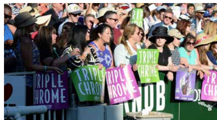
The paddock crowd cheers on 2014 Triple Crown hopeful California Chrome.