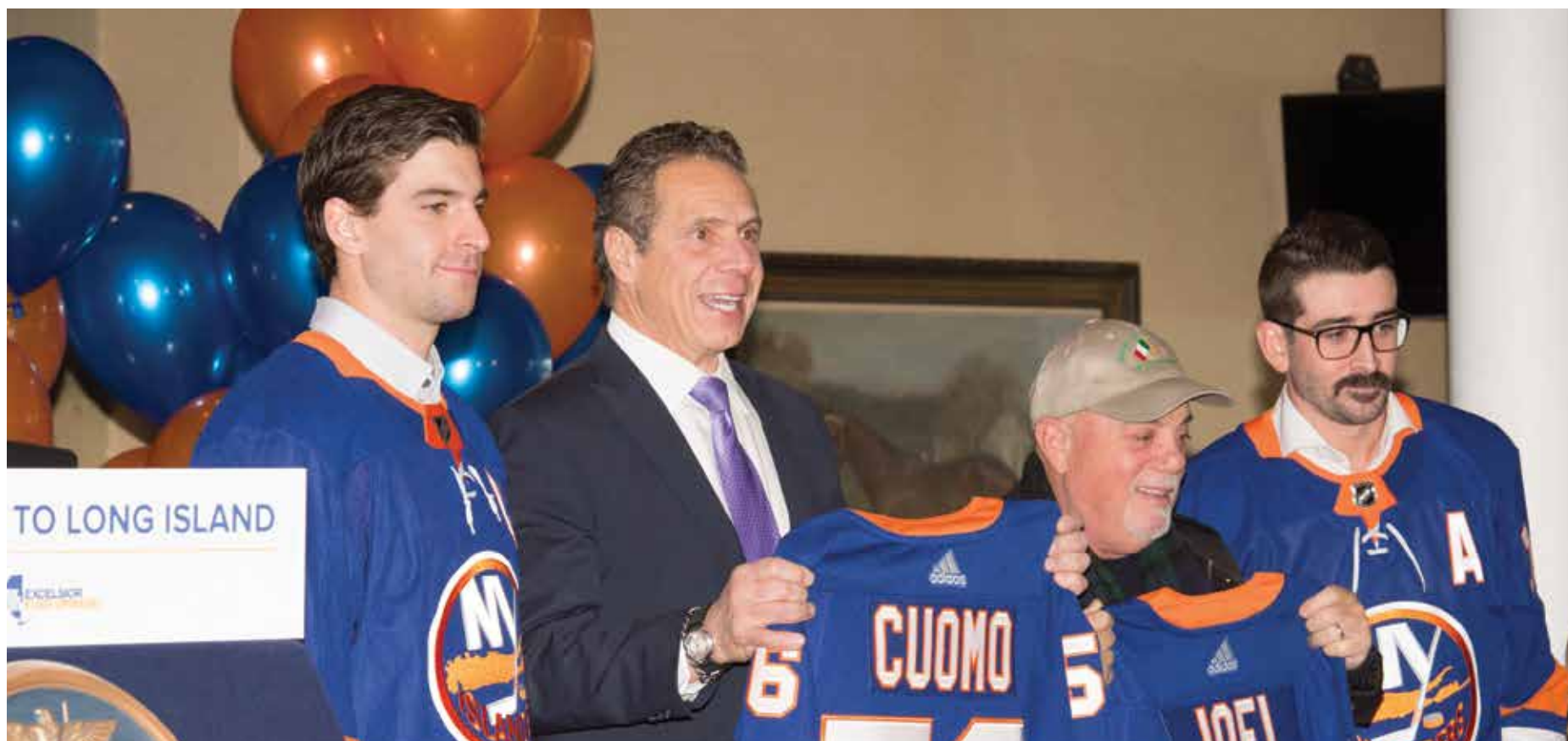
Islanders Center John Tavares, New York Governor Andrew Cuomo, Singer-songwriter Billy Joel and Islanders Right Wing Cal Clutterbuck display their Islanders' jerseys at the press conference.

Hockey and horse racing may sound like an unusual combination, but not in New York.