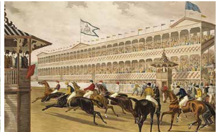
From 1867-89, the Belmont Stakes was held at Jerome Park in the Bronx.