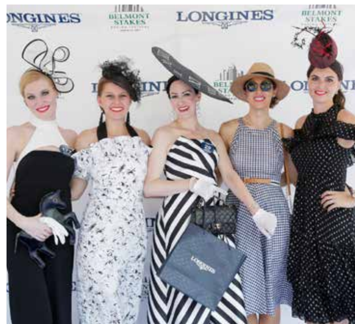
Fashion is a key part of the traditions at the Belmont Stakes.