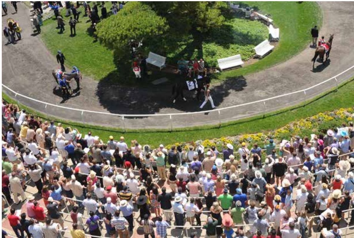
Fans line up around the paddock to view the horses before the race.