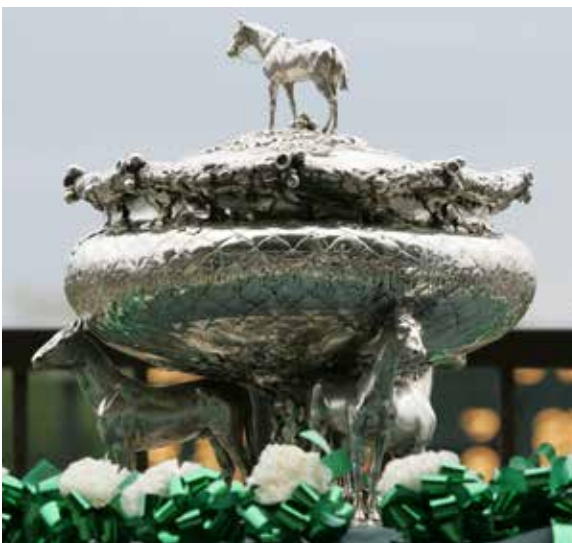
The owner of the horse that wins the Belmont Stakes receives the August Belmont Memorial Cup, a solid silver bowl and cover made by Tiffany's.