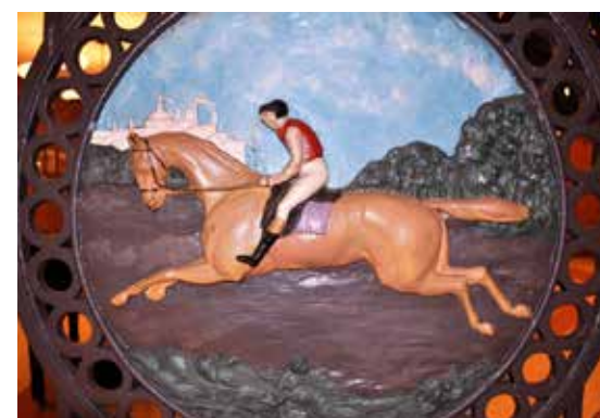
The gates of Jerome Park, where the Belmont Stakes was run from its inception in 1867 to 1889, are preserved on the fourth floor of the Belmont Park Clubhouse.

1 – lap around the 1½ mile track to crown the Belmont Stakes winner