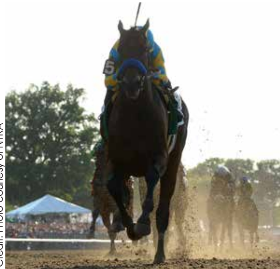
American Pharoah wins the 2015 Belmont Stakes to become the first Triple Crown winner in 37 years.

of 22 million watched on TV. Holding the lead from gate to wire, American Pharoah claimed his Triple Crown title at the Belmont Stakes by beating seven other horses by 5½ lengths in 2:26.65, the second fastest Belmont time of all Triple Crown winners.