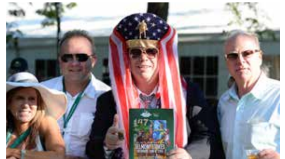
Fans turned out in droves to show their support for American Pharoah, the 2015 Triple Crown winner.