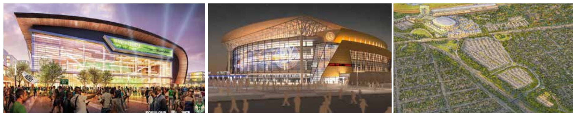
The NHL Islanders new home will be adjacent to the Belmont and will be the foundation for an extensive sports and entertainment development