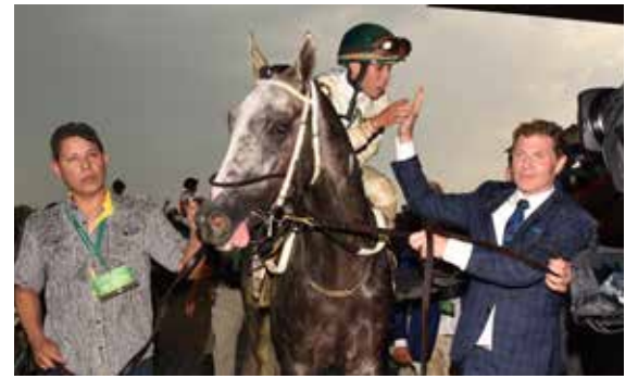
Celebrity Chef Bobby Flay (r) was part of the ownership group for 2016 Belmont Stakes champion Creator, ridden by Irad Ortiz Jr.